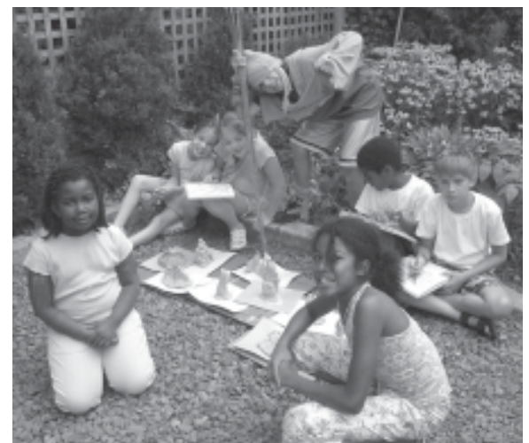
Above: Children express themselves in French and through art!

CPF plans to work with camp organizers over the winter to ensure that a quality French camp experience is offered in Hamilton in the summer of 2007.