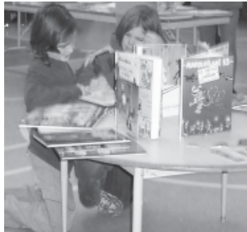
Above: There will be plenty to choose from at the upcoming French book sale and trade show.

Students, parents and teachers - take advantage of this opportunity to learn about the terrific opportunities French language learning creates!